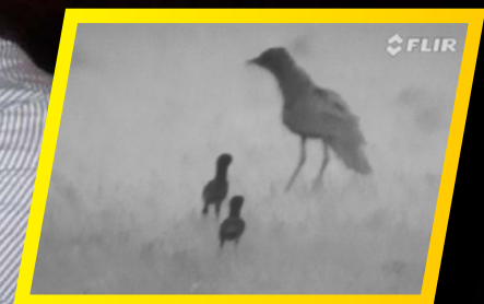
Bird images as seen through the FLIR