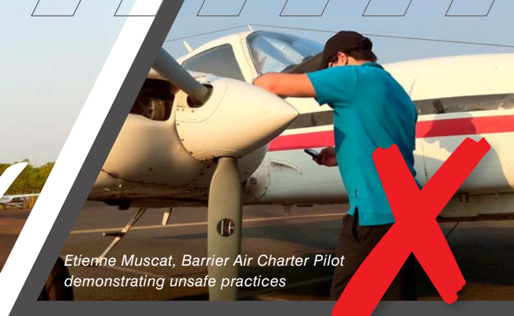
Etienne Muscat, Barrier Air Charter Pilot demonstrating unsafe practices